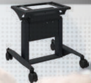
Laptop / keyboard support